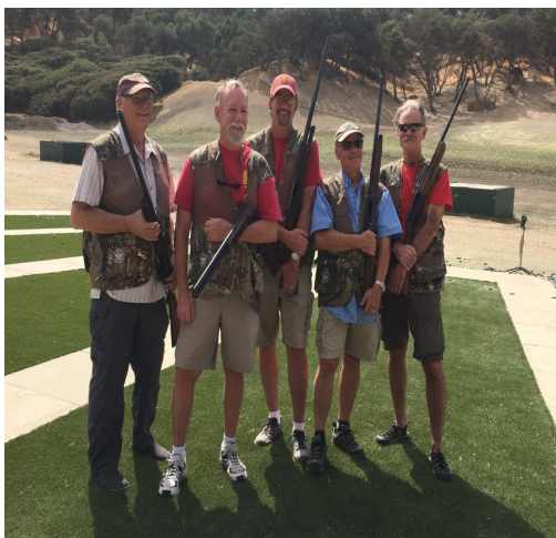
Troop 730 Shoot Out Team 10-7-16

November's Roundtable will have a breakout on the Trail to Eagle. So any parent or leader that is wondering what to do now that your son has Life? This month is for you! #EagleRank #<2%